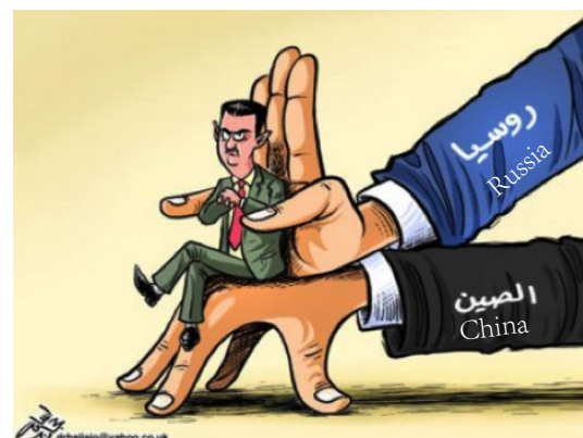
Cartoons published in the Arab press

Apparently, Beijing and Moscow are coordinating. But Beijing is second fiddle to Moscow and may have not been consulted before Russia's intervention to Syria. China has become a stooge which input is not taken into consideration and continues to play a marginal role in the Middle East. Western and Middle Eastern countries tend to overlook China and appeal directly to Russia as the more powerful facto affecting the region, keeping China in an outsider position. It seems all the more paradoxical since while Mao China had the will to interfere but not the capacities to do so, post-Mao China has growing capacities but no will to intervene. As a consequence, China's strategy of not taking side is expected to continue in the near future.